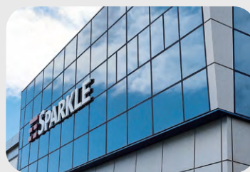
KOROPI Built Space: 2,580 m 2 Power: 2 MW