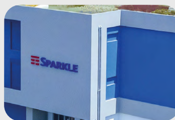
METAMORFOSIS II Built Space: 5,831 m 2 Power: 7.7 MW