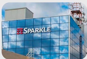
METAMORFOSIS I Built Space: 4,000 m 2 Power: 3.2 MW